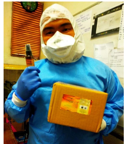
PGH COVID-19 Center Frontliners